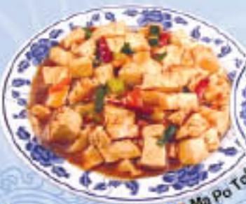
Ma Po Tofu

Price subject to change without notices.