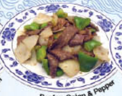
Beef w. Onion & Pepper