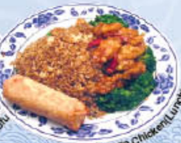
Orange Chicken Lunch