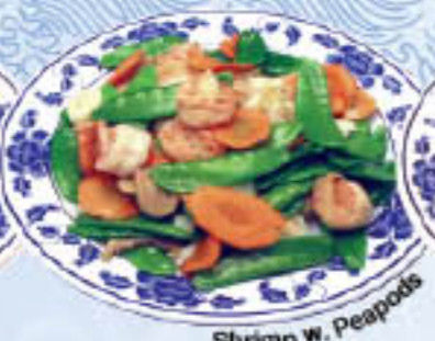
Shrimp w. Peapods